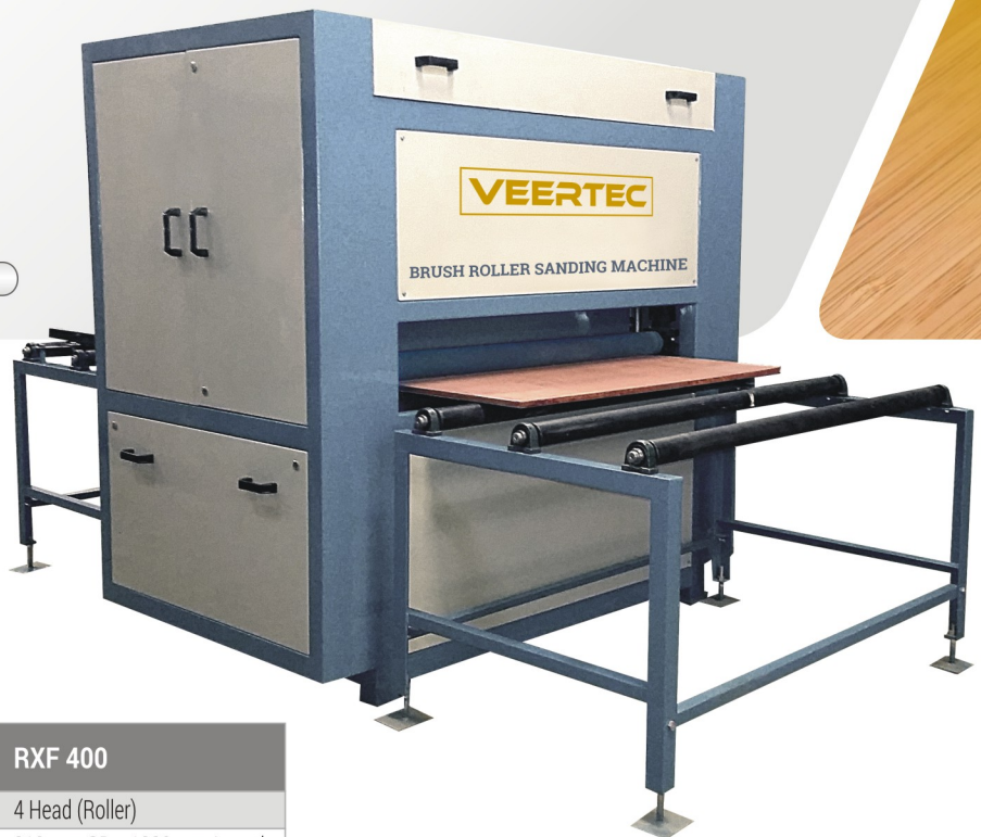
SEMI AUTO SANDING MACHINE