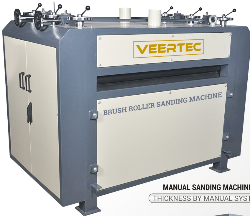
MANUAL SANDING MACHINE